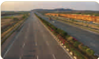
ORR (Tukuguda) - 20 Mins