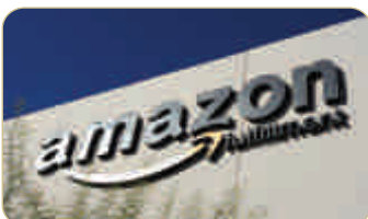
Amazon - 15 Mins