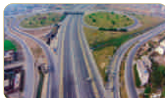
Regional Ring Road - 10 Mins