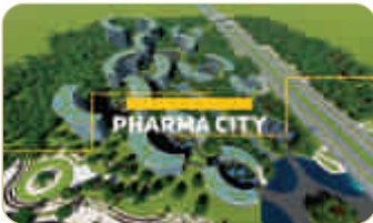
Pharma City - 2 Mins