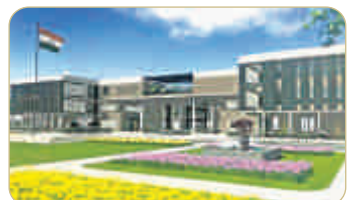
RR Dist. Collector Office - 25 Mins