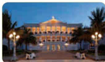
Falaknuma - 40 Mins