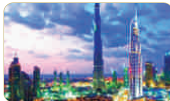
Fab City - 15 Mins