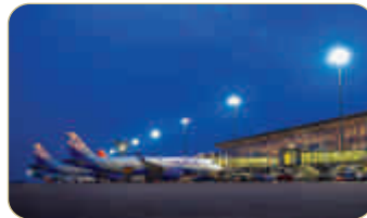
RGIA - 30 Mins