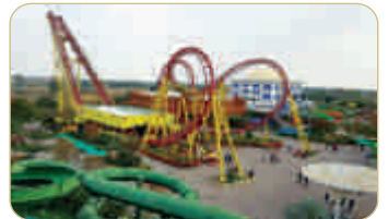
Wonderla - 25 Mins