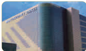
TCS Adibatla - 30 Mins