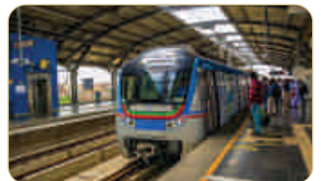
Metro LB Nagar - 55 Mins