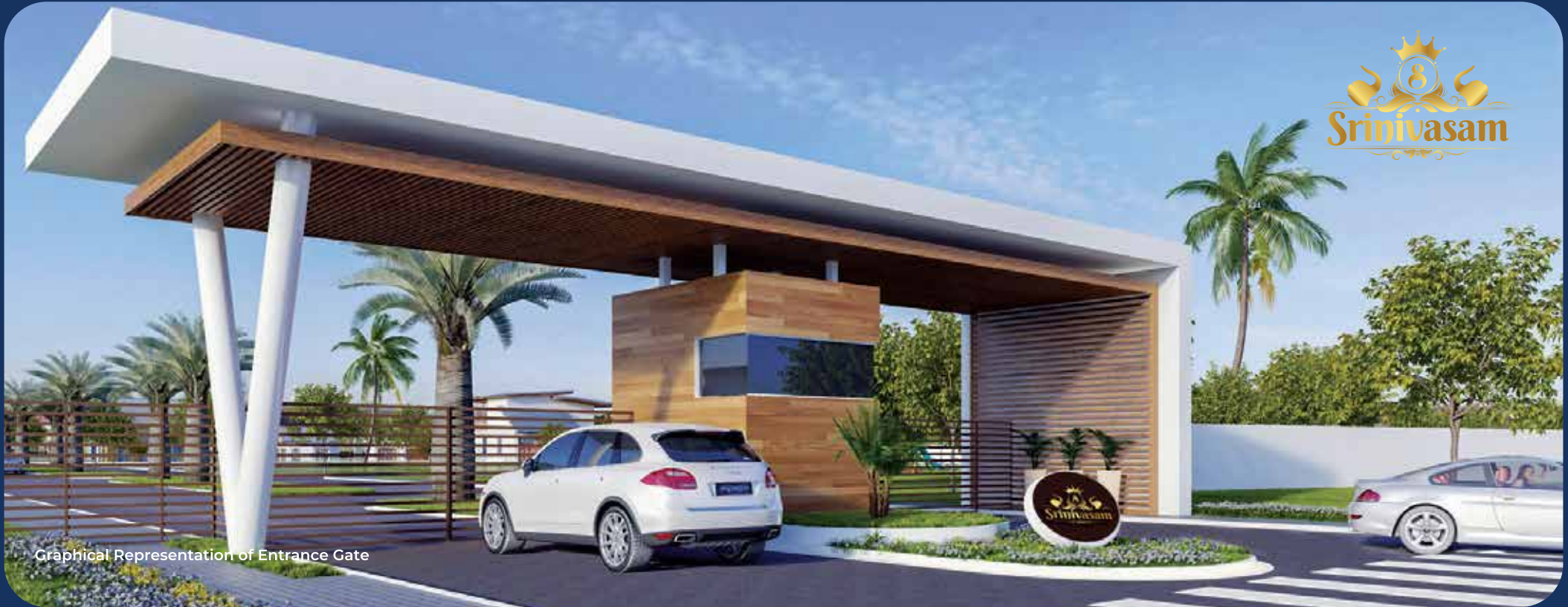
Graphical Representation of Entrance Gate