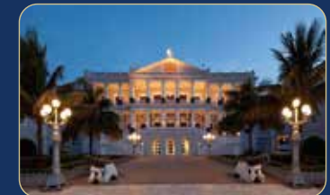
Falaknuma - 40 Mins