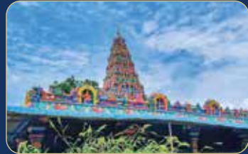
Maisigandi Temple - 5 Mins