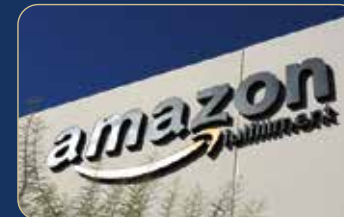
Amazon - 15 Mins