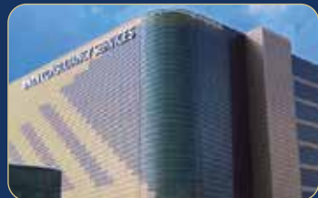
TCS Adibatla - 30 Mins