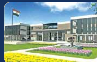
RR Dist. Collector Office - 25 Mins

Discover a newer tranquil experience where everything from well curated plots and sophisticated facilities rejuvenate the mind and soul. Each of the exquisite vastu compliant plot offers the best convenience and serene comfort.