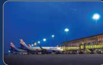
RGIA - 30 Mins