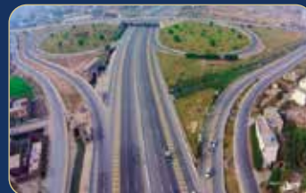
Regional Ring Road - 10 Mins