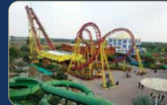
Wonderla - 25 Mins