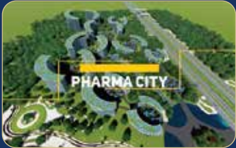
Pharma City - 2 Mins