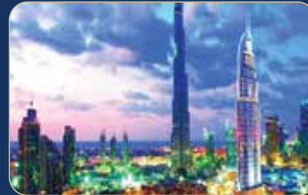
Fab City - 15 Mins