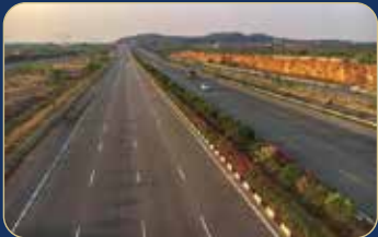
ORR (Tukkuguda) - 20 Mins