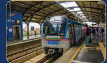
Metro LB Nagar - 55 Mins